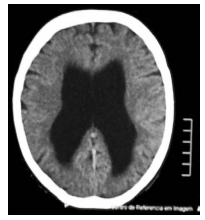
Figure 1. Skull CT showing hydrocephalus which is out of proportion to the degree of atrophy.

epileptic fits?). Complete blood count, and serum glucose, cholesterol, triglycerides, creatinin, urea, liver enzymes, sodium, potassium, B12, folic acid, thyroid stimulating hormones receptors (TSH), and FT4 were within the normal ranges. Serum carbamazepine was within the therapeutic range.